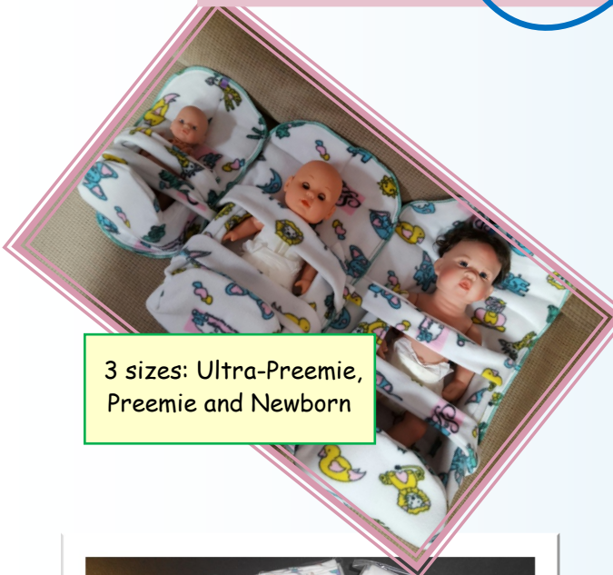
3 sizes: Ultra-Preemie, Preemie and Newborn

The Cuddle-Up "Hug" is so easy to position, cuddle and hug your preemie as if they were still in the womb. It quickly surrounds and interfaces with infant, providing soft boundaries. Foot and side walls are memory foam sealed in our reusable material. Just wipe with any disinfectant and wash the cover and it's ready to go.