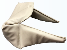
Reusable foot and sidewall support; Note high bottom to keep legs in a good fetal position