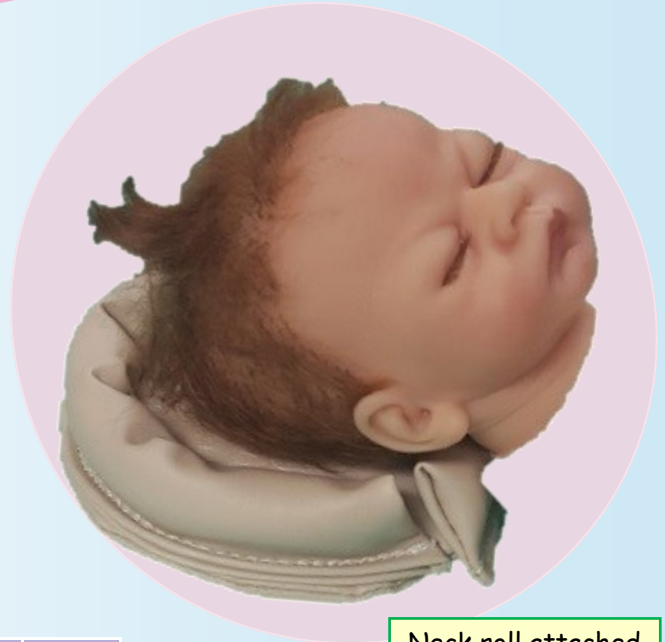
Neck roll attached